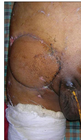
Figure 2: Well settled ALT perforator flap tunneled beneath intervening normal skin

have termed it as the 'tunneled' perforator flap based on the technique of transfer.