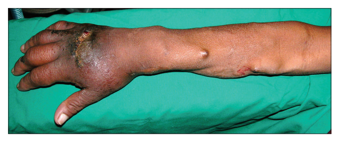
Figure 4: Venous hypertension.

The result also showed that vein <2 mm is significantly (P = 0.008) less likely to be successful [Table 2]. Artery and vein \ge 2 mm showed success in about three-fourth of the patients as compared with artery and vein